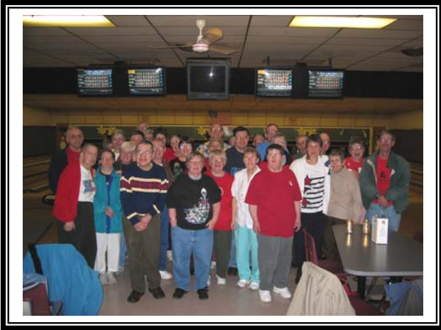
SOME OF THE GANG AT BOYD HOME FROM LAST YEAR