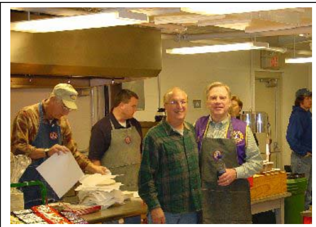
(Here is a picture of the Lion's Club Booth at the Rodeo that I'm helping at. This is King Lion beside me!)